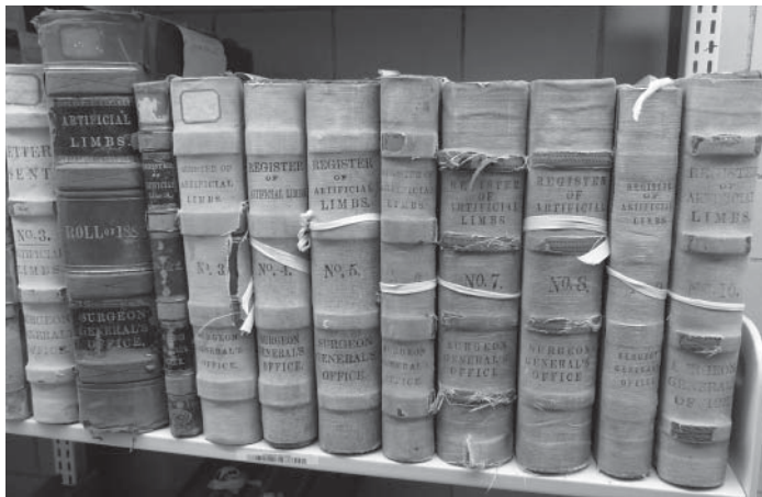
Some of the records relating to artificial limbs, trusses, and commutation in Record Group 15, Records of the Department of Veterans Affairs.

The numerous amputations endured during the Civil War boosted a new industry — prosthetics — that continues to innovate and improve mobility products needed by American veterans returning home from our era's wars in Iraq and Afghanistan. 🌳